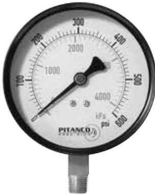
Illustrated model: 400A16